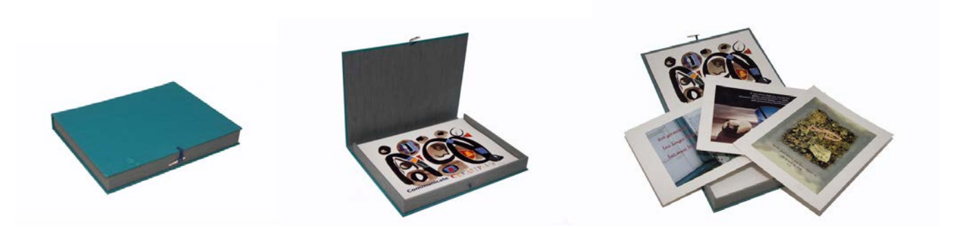
P5 Communicate Creatively , 2002; twelve (12) Giclée prints with illustrations and quotes on rag paper fitted in a light blue fabric presentation box.

Presentation box made by Scott Mullenberg: 12.75" (L) x 1.5" (D) x 9" (H)